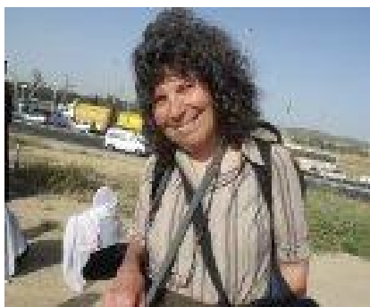
Near el-Arakib, Israel, April 2012